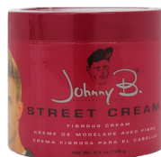
Street Cream 4.5 oz