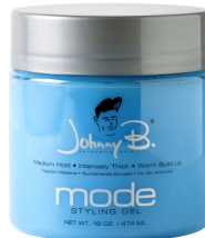
Mode 16 oz