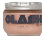
Clash 2.05 oz