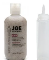
Scrub & Relax Oil