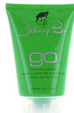
Go 4 oz