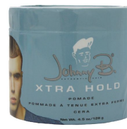
X-tra Hold 4.5 oz