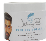
Original 4.5 oz