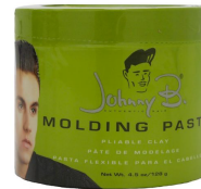
Molding Paste 4.5 oz