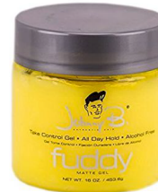
Fuddy 16 oz