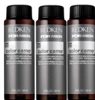
Camo Color -Light Natural -Medium Natural -Dark Natural