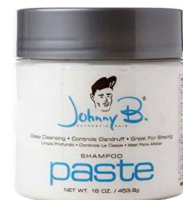
Paste 16 oz