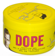
Dope 4 oz